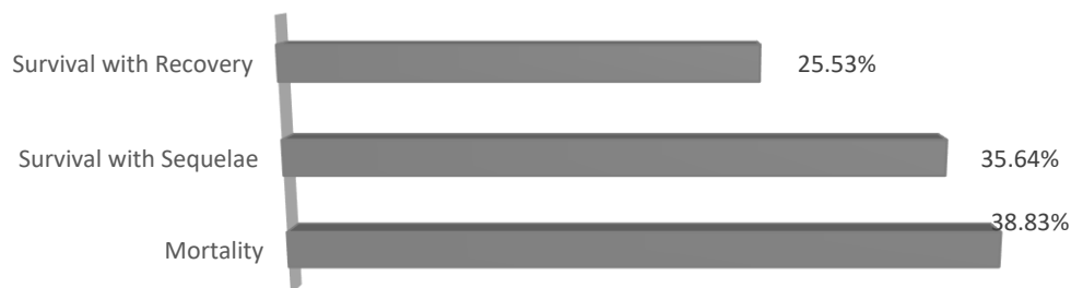
Figure 1: Outcomes in the Case of Methanol Poisoning

Figure 1 emphasizes that mortality is a predominant factor in the case of methanol poisoning.